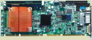
○ Single Board Computer