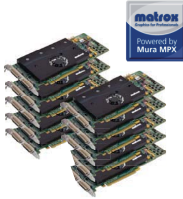
Up to 10 Matrox Mura™ MPX Series Graphic Cards