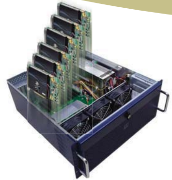
Portwell 4U Rackmount Display Wall System